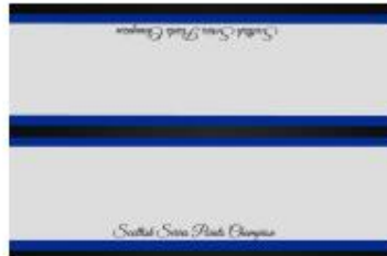
SCOTTISH SERIES CHAMPION