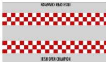
IRISH OPEN CHAMPION.