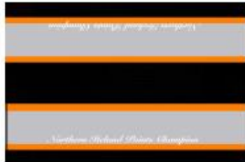
NORTHERN IRISH SERIES CHAMPION