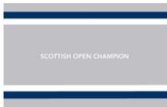
SCOTTISH OPEN CHAMPION.