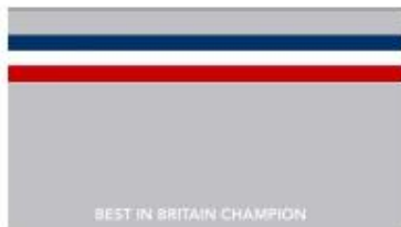
BEST IN BRITAIN CHAMPION