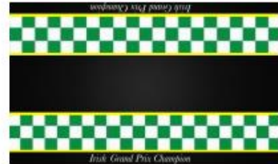
IRISH GRAND PRIX CHAMPION