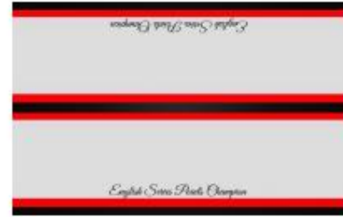
ENGLISH SERIES POINTS CHAMPION.