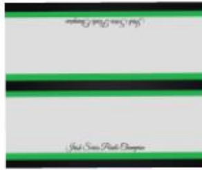
IRISH SERIES POINTS CHAMPION.