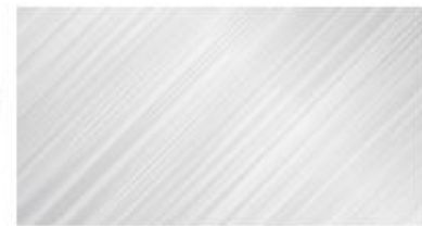
INTERNATIONAL POINTS CHAMP ----->

REVISED RULES FOR 2020 IN BOLD/ITALIC/RED PRINT ITEMS MARKED STRIKETHROUGH ARE NO LONGER ALLOWED 2020 Classic Hot Rod Construction Rules & Regulations Issue 6, Dated 31 st August 2020 These rules are to be enforced with immediate effect.