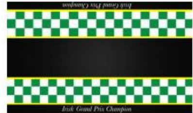
IRISH GRAND PRIX CHAMPION