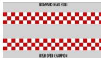
IRISH OPEN CHAMPION.