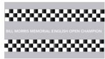
BILL MORRIS MEMORIAL ENGLISH OPEN CHAMPION