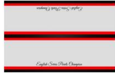
ENGLISH SERIES POINTS CHAMPION.