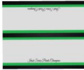
IRISH SERIES POINTS CHAMPION.