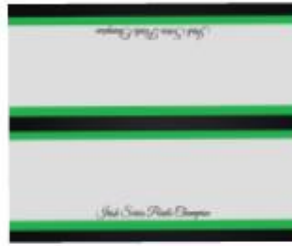
IRISH SERIES POINTS CHAMPION.