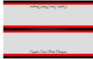
ENGLISH SERIES POINTS CHAMPION.