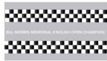
BILL MORRIS MEMORIAL ENGLISH OPEN CHAMPION