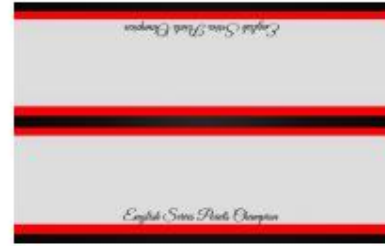
ENGLISH SERIES POINTS CHAMPION.