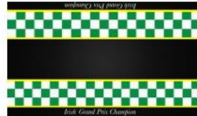
IRISH GRAND PRIX CHAMPION