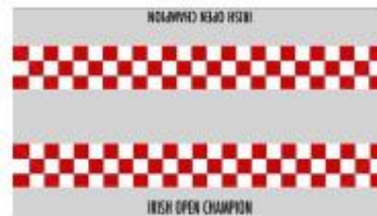
IRISH OPEN CHAMPION.