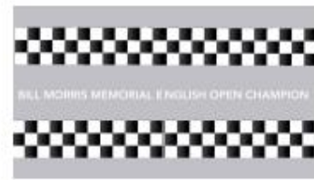
BILL MORRIS MEMORIAL ENGLISH OPEN CHAMPION