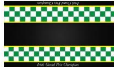
IRISH GRAND PRIX CHAMPION