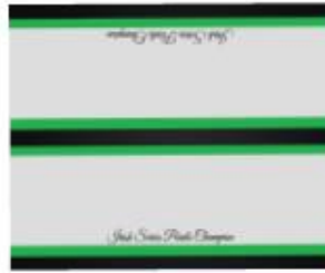
IRISH SERIES POINTS CHAMPION.