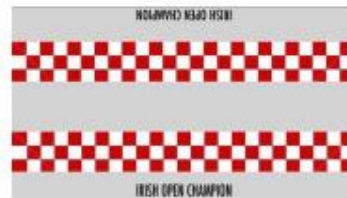
IRISH OPEN CHAMPION.