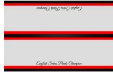
ENGLISH SERIES POINTS CHAMPION.